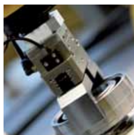
› Hydraulics and industry