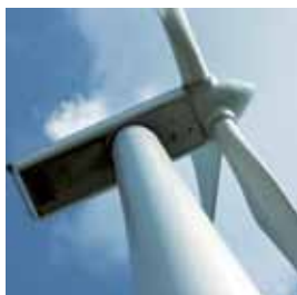
› Energy technology