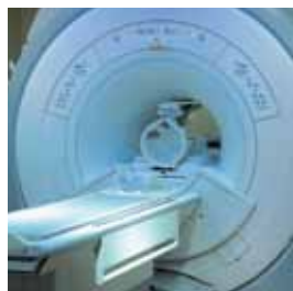
› Medical technology