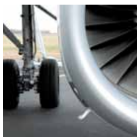
› Aviation and aerospace