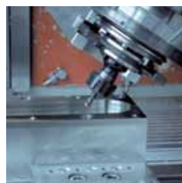
› Mechanical engineering