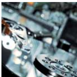
› Electrical engineering