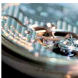
› Precision engineering