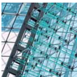
› Construction industry