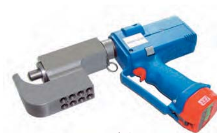
Battery Hand Riveter

A full charge takes around 60 minutes. The riveter can also be operated directly from a 230V mains connection. The riveting operation requires access on both sides.