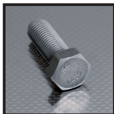
Hexagon head screw DIN 933 - M16x35 Duplex stainless steel mat.-no.: 1.4462