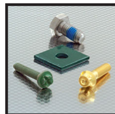
Coated fastening elements: PFTE, powder, Tuflok, gilding