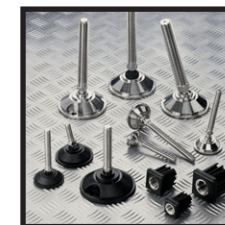
Diverse ball jointed levelling feet

High quality ball jointed levelling feet (stainless steel or nickel-plated steel) for assembling and levelling machines, units and apparats