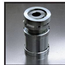
Ball head precision leveller with locking nut zinc steel – type: KVSK 50-22

Patented levelling elements (stainless steel or zinc steel) for adjusting, connecting and levelling all kinds of machines and plants