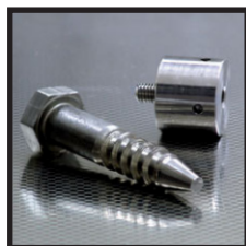
After reworking drawing of a hexagon head screw DIN 931-M16

Fastening elements with special treatment of surface - locking features for safety - increased protection - improvement of conductivity - perfect visual appearance